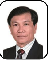
Ismael Tabije Service Projects